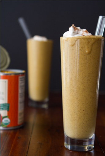
Creamy Pumpkin Pie Smoothie (Dairy Free)