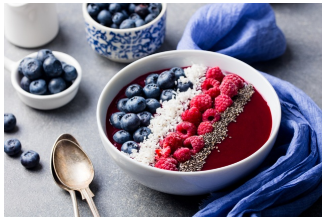
Non-Dairy Blueberry Smoothie Bowl