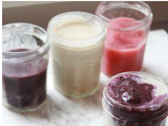
Red, White & Blue Smoothie